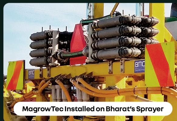
MagrowTec Installed on Bharat's Sprayer